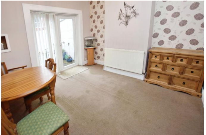
Lounge 10' 5" x 11' 8" (3.17m x 3.56m) Front aspect uPVC double glazed window (

Rear aspect uPVC French doors lead to the rear garden. Radiator. Opening through to