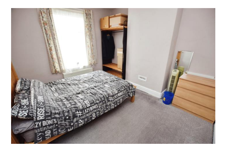
Bedroom Three 9' 7" x 6' 10" (2.93m x 2.09m) Rear aspect uPVC double glazed window. Coved ceiling. Radiator.